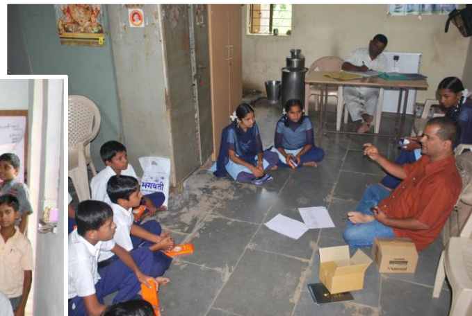
Mentoring Gifted Youth