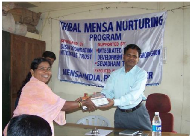
Material for Distribution to Tribal Schools